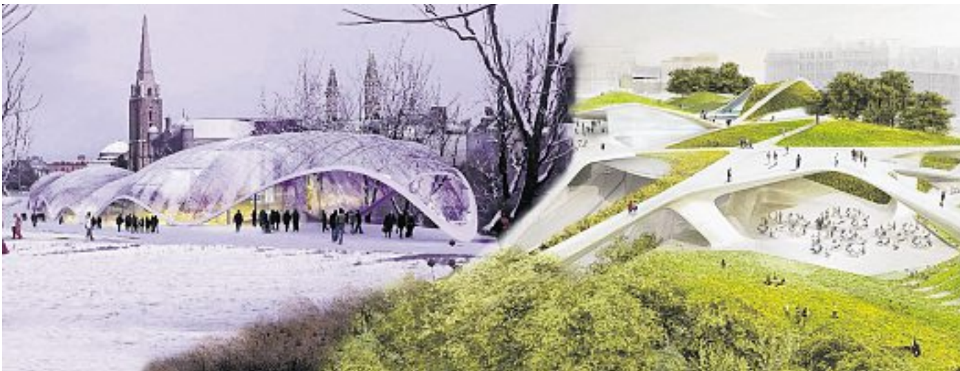
GREAT PLANS: Right, the design submitted by Granite Web and left, the design submitted by Winter Garden during the contest