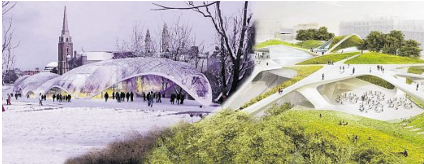
GREAT PLANS: Right, the design submitted by Granite Web and left, the design submitted by Winter Garden during the contest