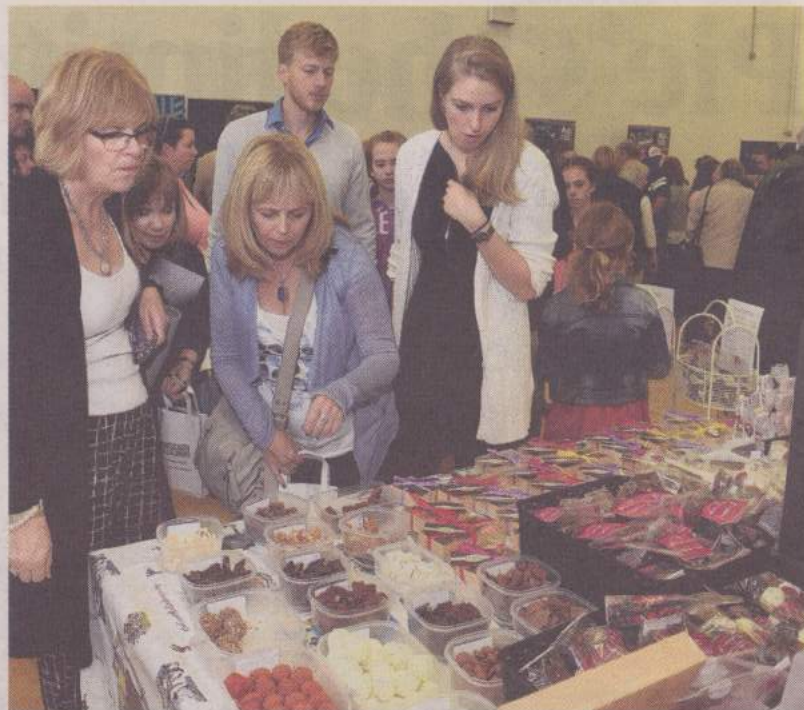
FEAST YOUR EYES: Visitors to the Deeside Food Festival.

"The festival has gone from strength to strength and I think with having such a larder of fresh produce in the region, the festival is just a great way to come together and create something special."