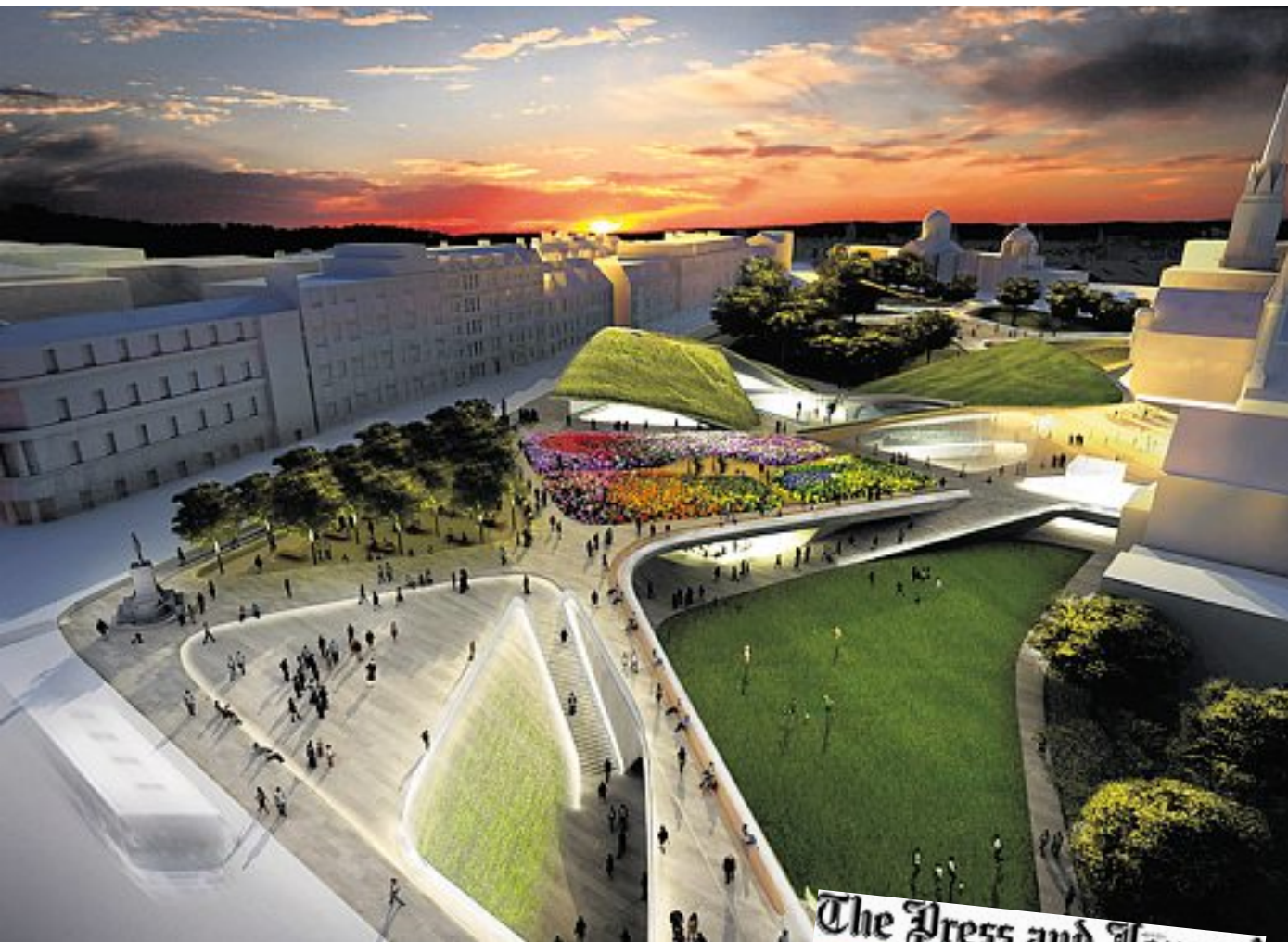
BRIGHT CITY: A computer-generated image of the winning redesign as seen in the evening and inset, one of many P&J front pages over the years about the scheme

"A decision was taken to back Sir Ian's proposal and reject the Peacock plan"